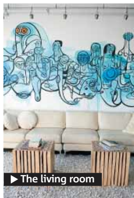
► The living room

The loft features an eclectic collection of art curated by Blesso himself. Graffiti artist Doze Green (www.doze.green.com) created the serene blue figures sweeping the interior walls in the living area. A hazy Buddha in the bedroom keeps vigil over Blesso's bed, and a glowing skeleton of Blesso's own X-rays, backlit by an LED screen, welcomes guests in the hall.