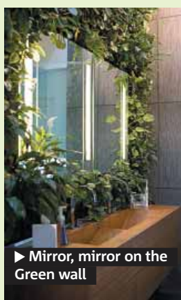
▶ Mirror, mirror on the Green wall

▶ This table was carved from one fallen tree from the Pennsylvania wilderness.