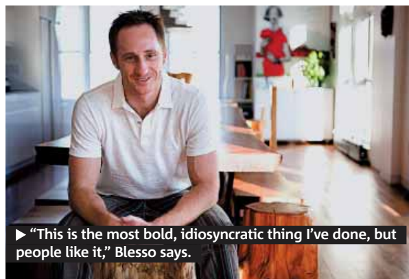
▶ "This is the most bold, idiosyncratic thing I've done, but people like it," Blesso says.